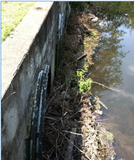
Culverts clogged with branches can cause upstream flooding during heavy flow.

If there is debris or woody material within or immediately upstream of a culvert or bridge that could result in blockage of the structure, it may be helpful to remove the material. While permits are needed when equipment must be brought into a stream, removing debris by hand or with heavy equipment staged above the stream bank is allowed (provided there is no disturbance to the stream bed or banks). It is not typically recommended to remove woody debris from streams because it can help to calm water and provide habitat, but woody debris (i.e., branches, logs, etc.) in a culvert should be removed so they don't catch moving material and cause a blockage. If you have questions, contact your NYSDEC Regional Permit Administrator or SWCD (see contacts directory).